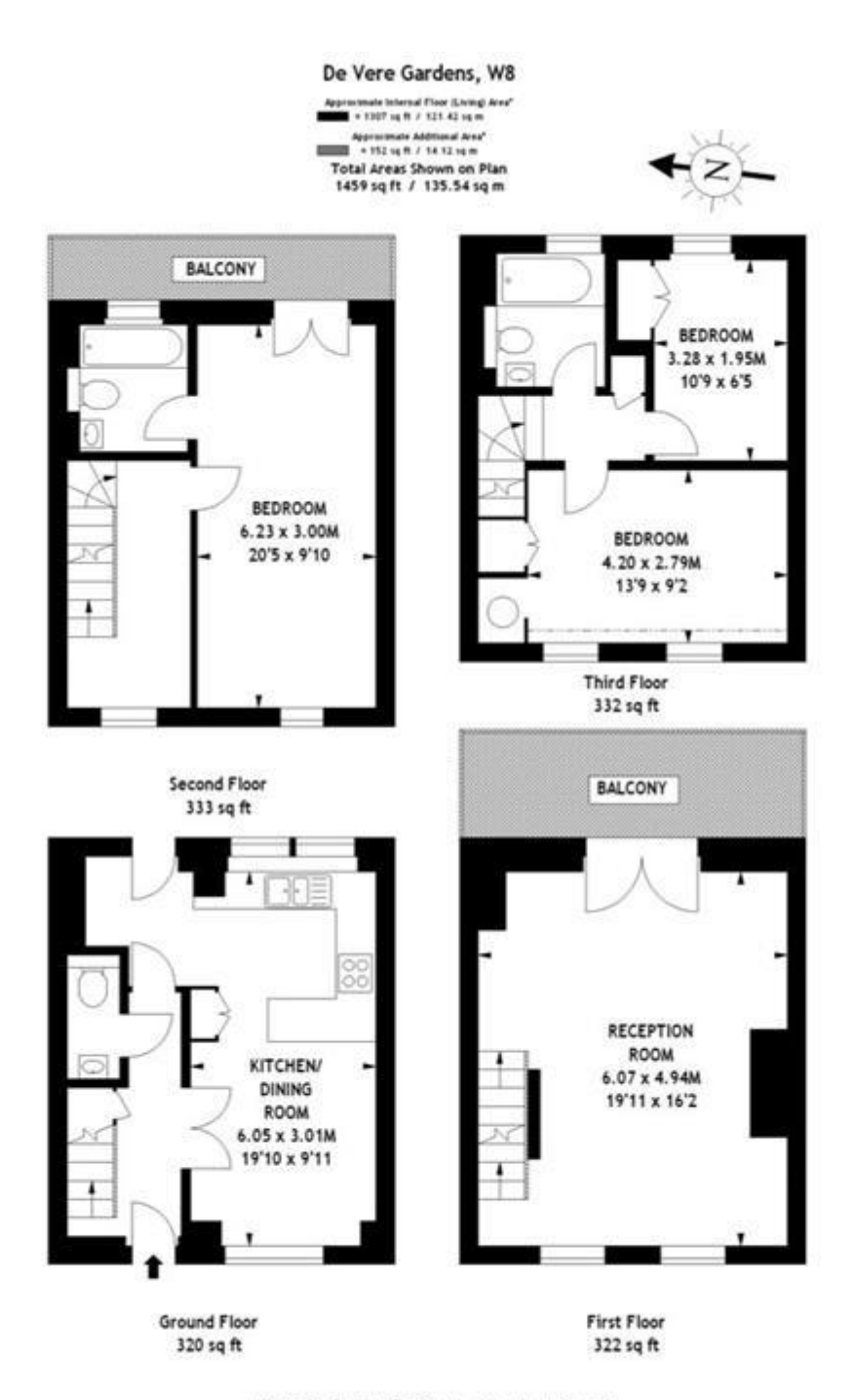
Illustration for identification purposes only, not to scale All measurements are maximum, and includes wardrobes and window bays where applicable